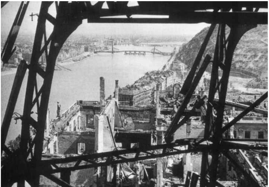
Budapest in 1945 seen from Castle Hill with the destroyed Danube bridges.