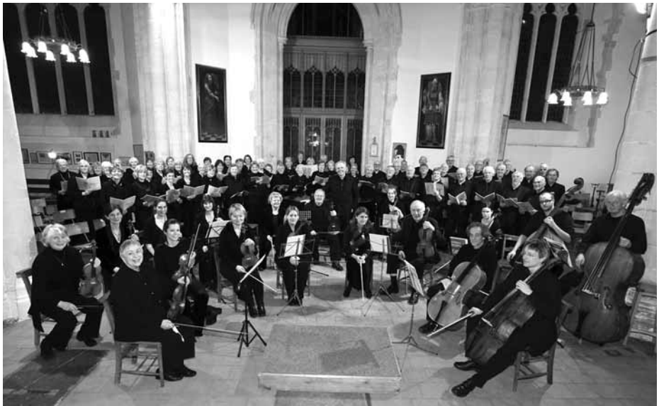
60th Anniversary Concert at Orford Church on Saturday 10 March 2012.