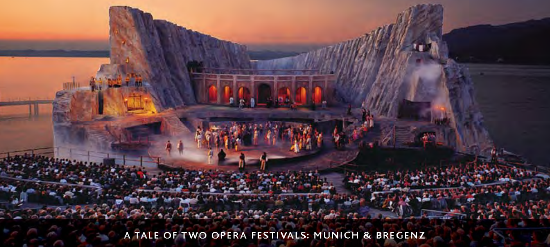
A TALE OF TWO OPERA FESTIVALS: MUNICH & BREGENZ