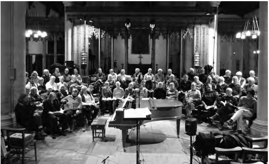
Photograph taken during a break in the recording session at Orford Church on 1 December 2015. Aldeburgh Music Club was featured on BBC Radio 3 'The Choir' programme broadcast on Sunday 3 April 2016. The broadcast included excerpts from the recording session.