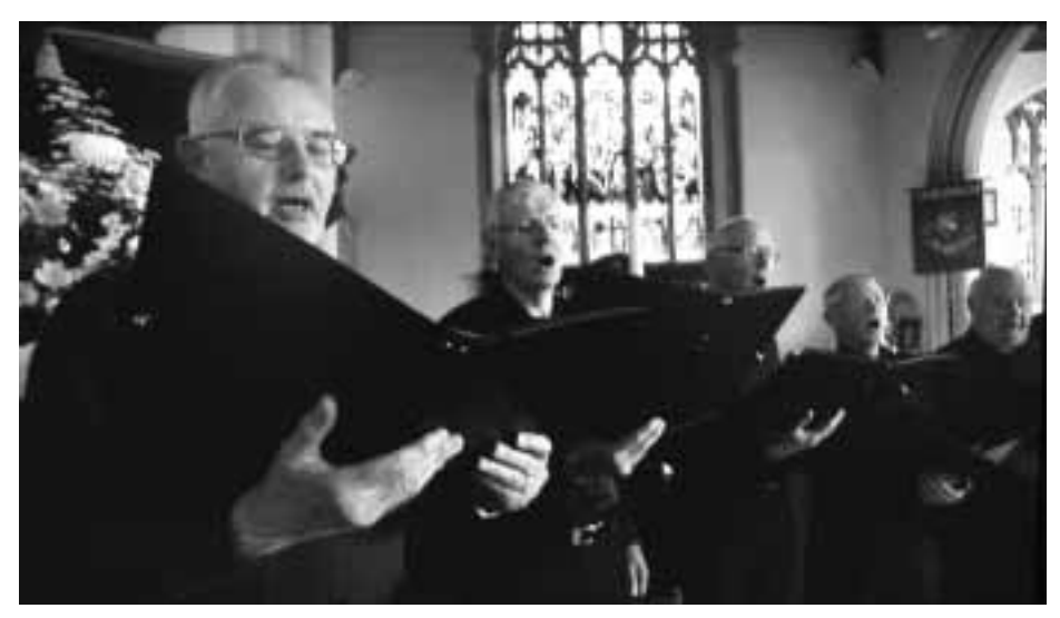
Members of Aldeburgh Music Club performing Britten's Curlew River on the BBC Countryfile programme