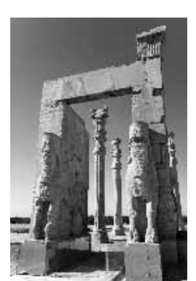
Gates of the Nations Persepolis, Iran

Let's imitate her notes above; and may this evening ever prove, sacred to harmony and love.