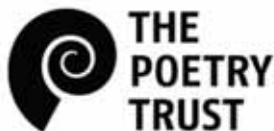
Sonnets by the Sea