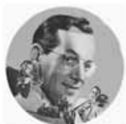
Get 'In The Mood' at Snape Proms