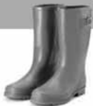
The Literary Arena at Latitude Festival