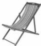
Relax with Suffolk Cottage Holidays!

There's an endless list of great things to do in Suffolk. But you need an ideal base to get the most from your visit.