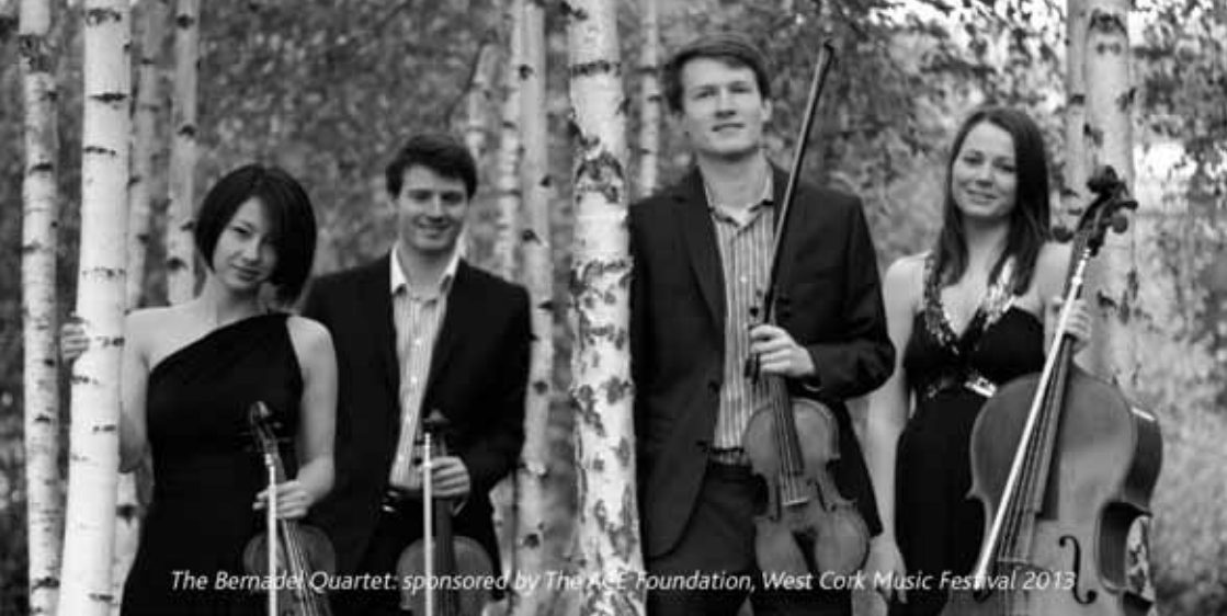
The Bernadel Quartet: sponsored by The ACE Foundation, West Cork Music Festival 2013