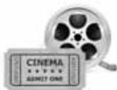
A film at Aldeburgh Cinema