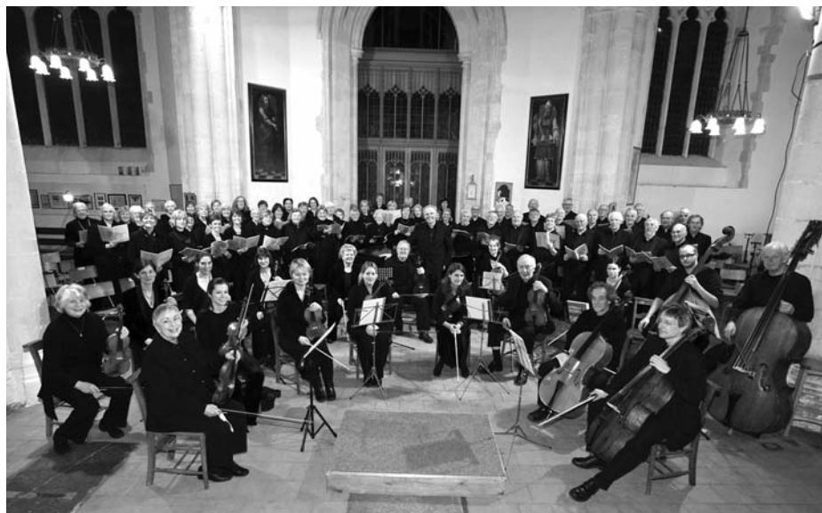
60th Anniversary Concert at Orford Church on Saturday 10 March 2012.