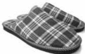
or simply relaxing in your Suffolk Cottage Holiday home!