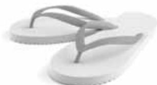
Crabbing at Walberswick