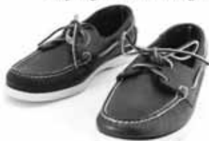
Sailing on the Deben