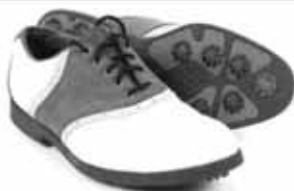
Golfing at Aldeburgh