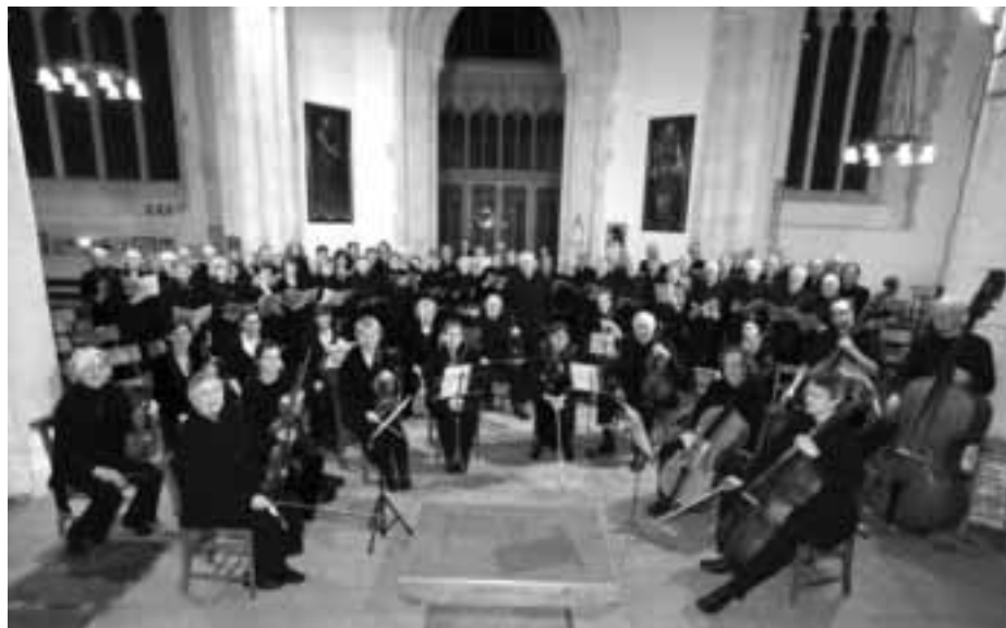
60th Anniversary Concert at Orford Church on Saturday 10 March 2012.