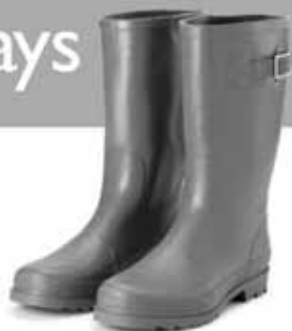
Partying at Latitude