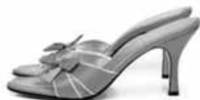
Dining out in Southwold