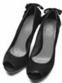
Concert at Snape Maltings