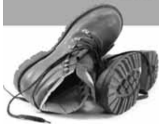
Birdwatching at Minsmere