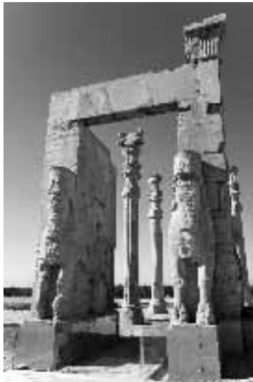
Gates of the Nations Persepolis, Iran

Your voices tune, and raise them high, till th'echo from the vaulted sky the blest Cecilia's name; Music to heav'n and her we owe, the greatest blessing that's below; Sound loudly then her fame. Let's imitate her notes above; and may this evening ever prove, sacred to harmony and love.