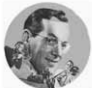
Get 'In The Mood' at Snape Proms